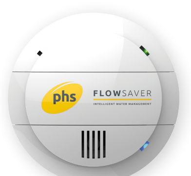
The FLOW SAVER URINAL water managment