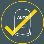
Contactless hand sanitation

It can be hard to know what hygiene products are suitable for your business, especially as the marketplace has become so crowded in reaction to COVID-19. The phs COVID-secure bundle is designed to provide you with everything you need to keep your customers and employees safe throughout the pandemic and beyond.