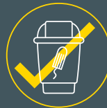
Auto sanitary bin