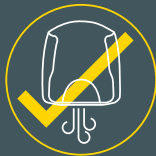
HEPA filter hand dryer